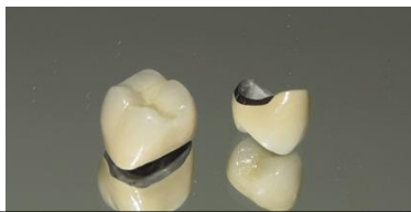
PORCELAIN FUSED METAL CROWN

We encourage you to ask your dentist about the difference in the materials above.