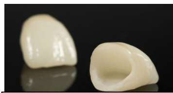
FULL PORCELAIN CROWN